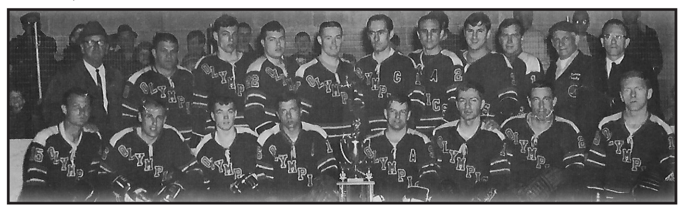
Concord Eastern Olympics 1967-68 Team

The new league was called the Northern New England Hockey League and competition included the Manchester Blackhawks, Berlin Maroons and the Lewiston Auburn Twins.